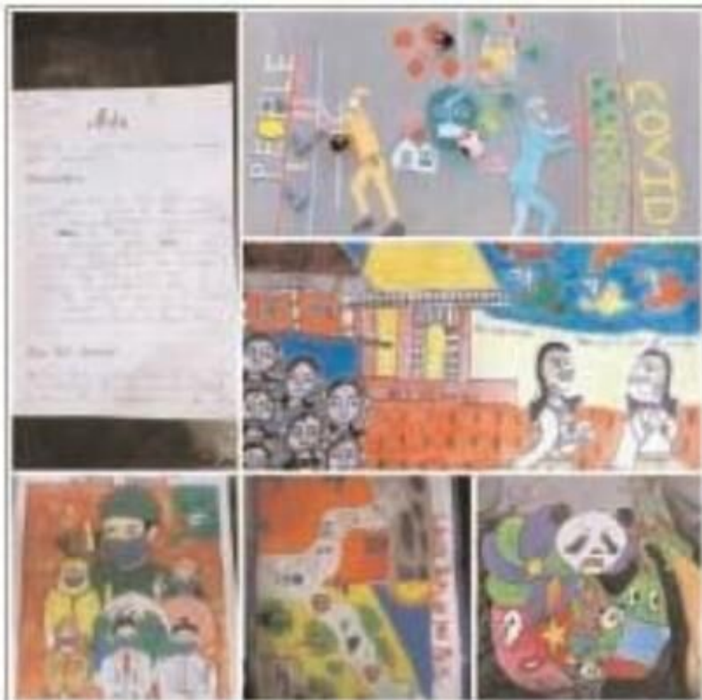
Participants from different levels of Institutions Schools, Colleges and Universities actively participated. In poster

On this occasion Sports & Red Ribbon club of the Government Degree College Kalakote with the collaboration of JKACS organized Painting competition, Poster making and essay writing competition on the themes "Mask Designing, Drug da addiction, Covid-19, Public Health Crisis HIV/AIDS,